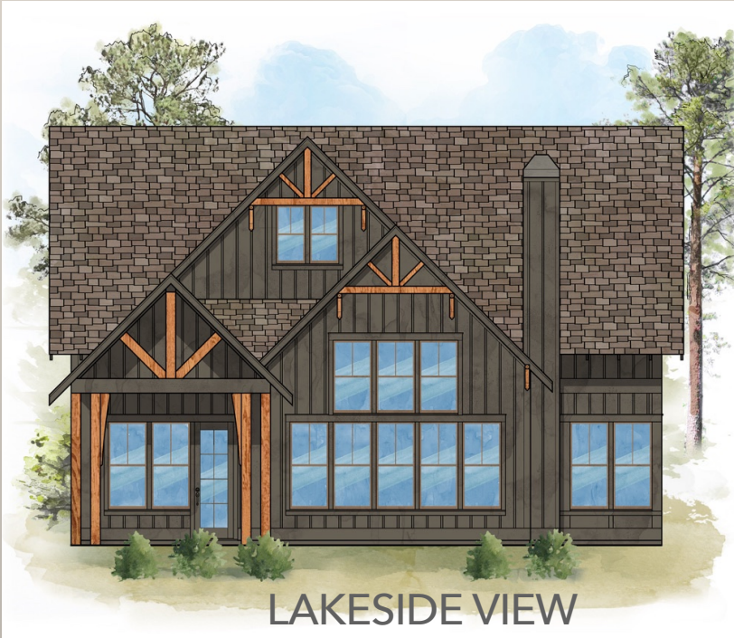
LAKE SIDE VIEW

Lake home design with open concept kitchen and great room that flows onto a covered lakeside porch. Large pantry and natural light will impress!